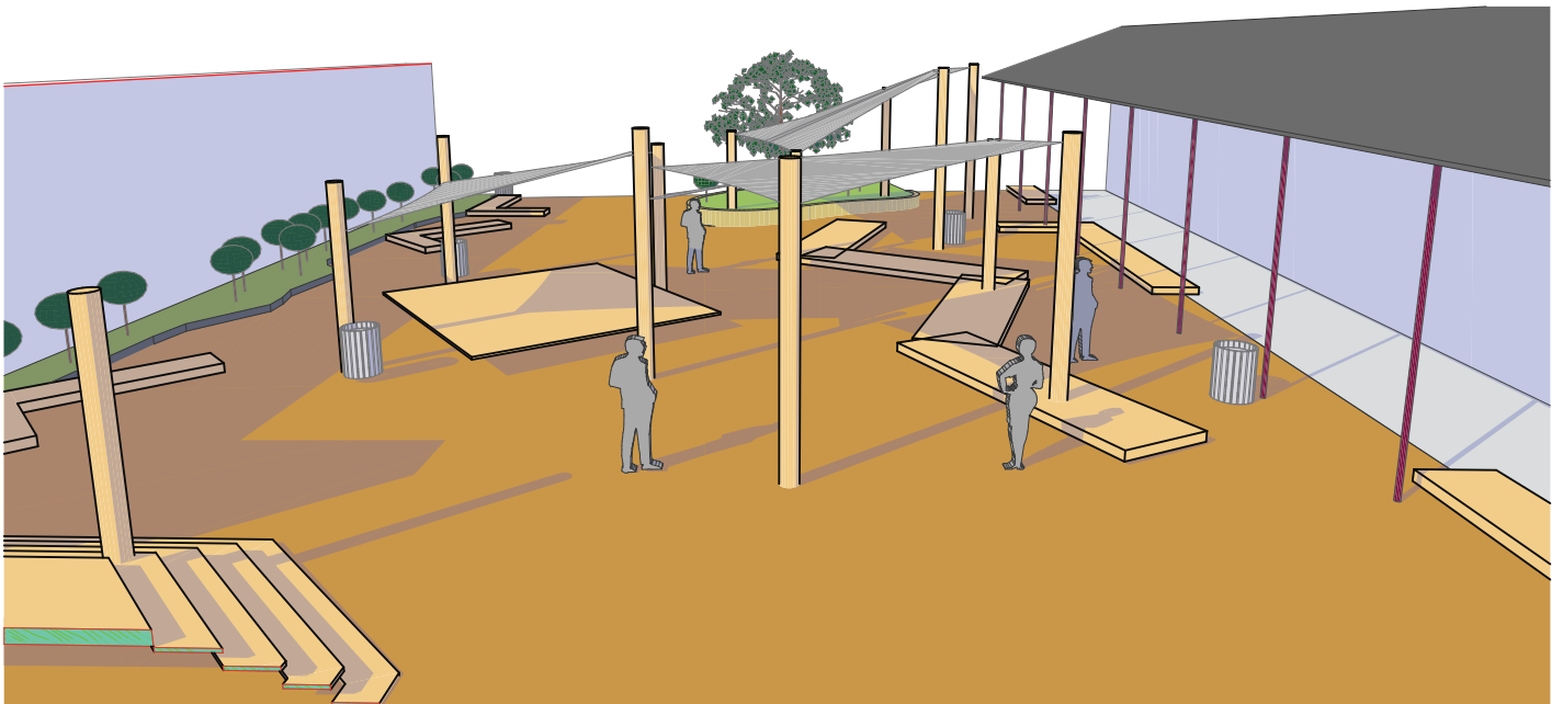
v3 Sun Study - July 20 1300

do not scale . contractors shall verify all dimensions on site . this drawing and the design it covers shall remain the property and copyright of the Architects .