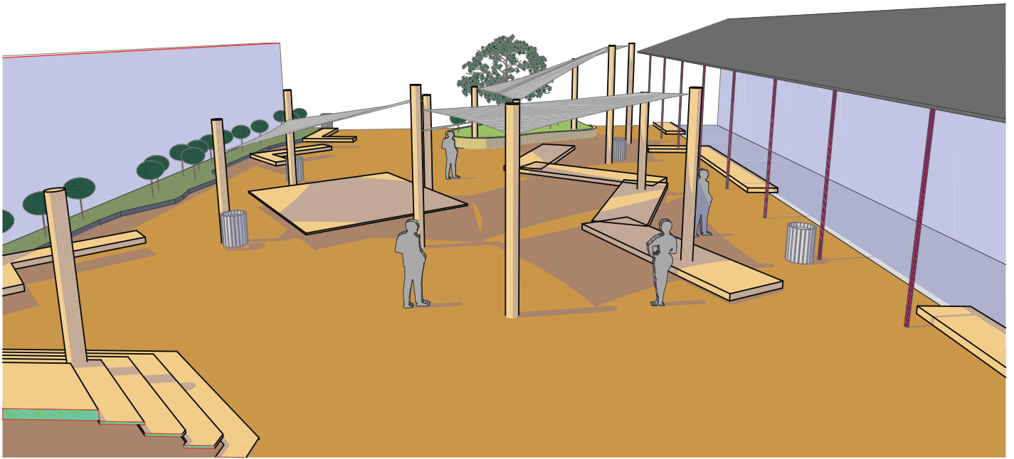
v2 Sun Study - Feb 20 1300